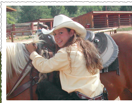
Saddle up for a fun ride!